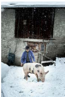
Swiss Stories © Helmut Wachter, Swiss Press Photo Happy End, tagesanzeiger.ch, bernerzeitung.ch, baslerzeitung.ch, derbund.ch