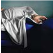
Daily Life