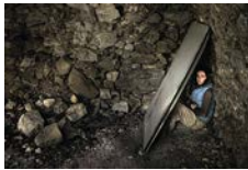
World © Jean Revillard, Swiss Press Photo Les électrosensibles L'Hebdo