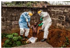
General News Freetown, Sierra Leone Medical staff at the Hastings Ebola Treatment Center work to escort a man in the throes of Ebola-induced delirium back into the isolation ward from which he escaped.