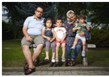
Swiss Press Photographer of the Year 2014 Drame de l'asile – une jeune femme syrienne Le Matin Dimanche

Pictures in print quality can be downloaded from the “Media” section of the website www.chateaudeprangins.ch . They may only be used for media coverage and the picture captions must be included.