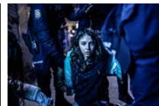
Spot News © Bulent Kilic , Turkey, Agence France-Presse Istanbul, Turkey A young girl is pictured after she was wounded during clashes between riot-police and protestors